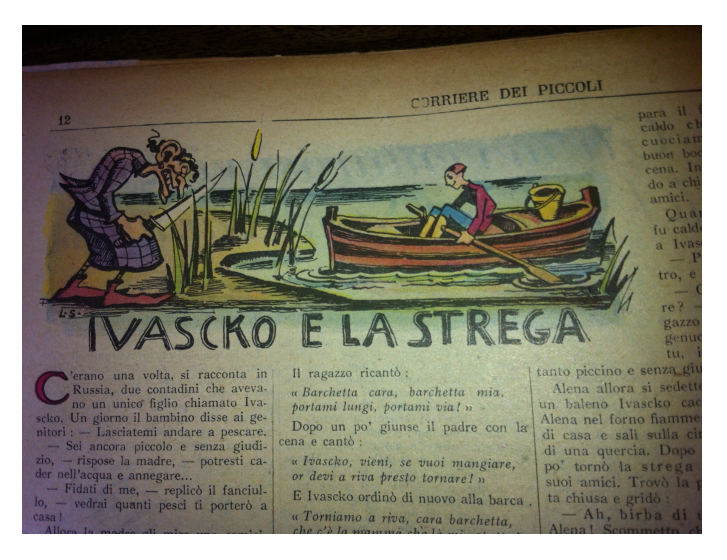
Figure 2. The illustration by the Russian artist Liliya Slutskaya

of freedom of imagination and escape from everyday life. Moreover, the Russian fairy tale combined the exoticism and mystery that had always shrouded Russia in the collective Italian consciousness. In 1926 the educator Giuseppe Fanciulli noted the only truly clear side of the 'mysterious' character of the Russian people: