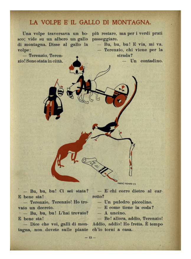
Figure 3. Fiabe popolari russe. (1923). Adattamento di E. Cadei (ill. Di M. Pompei). Il giornalino della Domenica, 15

"Nadia and the White Mouse" [Grigor'eva 1929] writes an autobiographical story "Polkan" for «Il Corriere dei piccoli» [Grigor'eva 1929a]. The same nostalgic spirit pervades short anonymous stories, such as "Cuore di re", published in «Il Corriere dei piccoli», which extols the generosity of the deceased Tsar [Cuore di re 1924]. Such details implicitly drew the attention of young readers to the events that had taken place in Russia and pointed to the reasons that forced the emigrants to leave their homeland. It is interesting to note that the dramatic situation in post-revolutionary Russia and the tragedy of Russian exiles was not concealed from children. In addition to chronicles, these events were reflected in articles